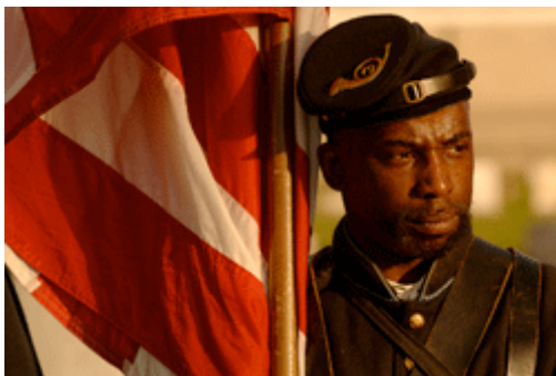
A reenactment at Gettysburg.

We had no sooner filed our final report on the 2006-2007 research project, The Power of Place: Understanding the African American Experience Along the Journey Through Hallowed Ground , when we got the exciting call that we received a second grant to create a book detailing the 100 sites and personalities profiled in The Power of Place .