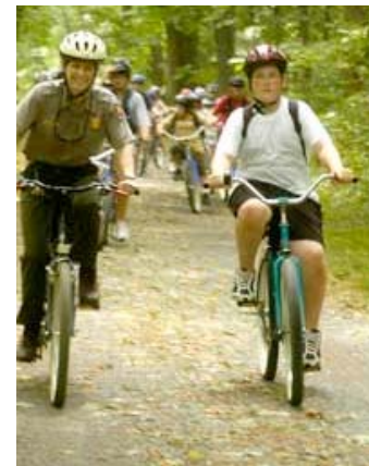
C&O Park Ranger leads campers through the C&O Canal

In mid-July, the group of sixth through eighth grade students got a hands-on lesson in American heritage and leadership. Working with expert historians and National Park Service Rangers, students posed as spies to uncover the region’s rich history from the Revolutionary period through the Civil War.