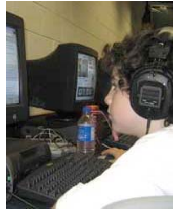
A student creates his vodcast in the filmmaking lab

As a testament to last summer's success, the program, co-sponsored by The Journey Through Hallowed Ground Partnership, has expanded from one session in 2006 to two sessions this summer: one offered by Albemarle Public Schools and one offered by Loudoun County Public Schools. JTHG hopes to raise additional funds to underwrite the 2008 Extreme Camp and encourage students from other counties to Take the Journey™ . Support this fantastic effort and donate today!