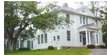
The Old School

The Waterford Foundation is a community organization dedicated and interpreting the National Historic Landmark District of Waterford, Virginia. That district encompasses the early Quaker village of Waterford and its extraordinary collection of 18th and 19th century buildings set within 1,420 acres of rolling farmland. Founded in 1773, Waterford was the only town in Virginia to stay loyal to the Union during the Civil War, and is rich with African American History.