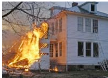
The auditorium was a total loss.