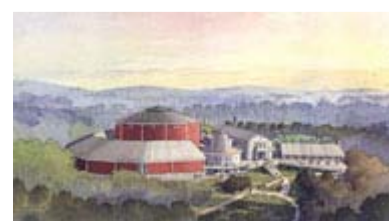
New Museum and Visitor Center, courtesy

Join the Gettysburg Foundation for a weekend of celebratory events in honor of the new 139,000 square foot facility. This wonderful addition features a new park visitor center with a 24,000 square foot museum on Gettysburg in the Civil War, a new twenty-two minute film about the Battle of Gettysburg entitled, "A New Birth of Freedom", the fully restored Gettysburg Cyclorama painting, Refreshment Saloon, Museum Bookstore, classrooms, curatorial and administrative offices. The project is funded by the non-profit Gettysburg Foundation, in cooperation with Gettysburg National Military Park. Free. For more information and a full list of special events, visit: www.gettysburgfoundation.org