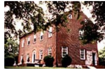
Liberia Plantation.

For more information and locations, visit: www.manassasmuseum.org or call 703.368.1873.