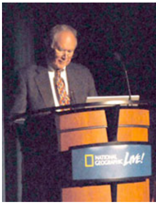
Gilbert Grosvenor, Chairman, National Geographic Society, giving opening remarks

On September 16, more than 200 guests filled the National Geographic Society's Grosvenor Auditorium for a very special installment of National Geographic Live! celebrating the publication of Journey Through Hallowed Ground: Birthplace of the American Ideal .